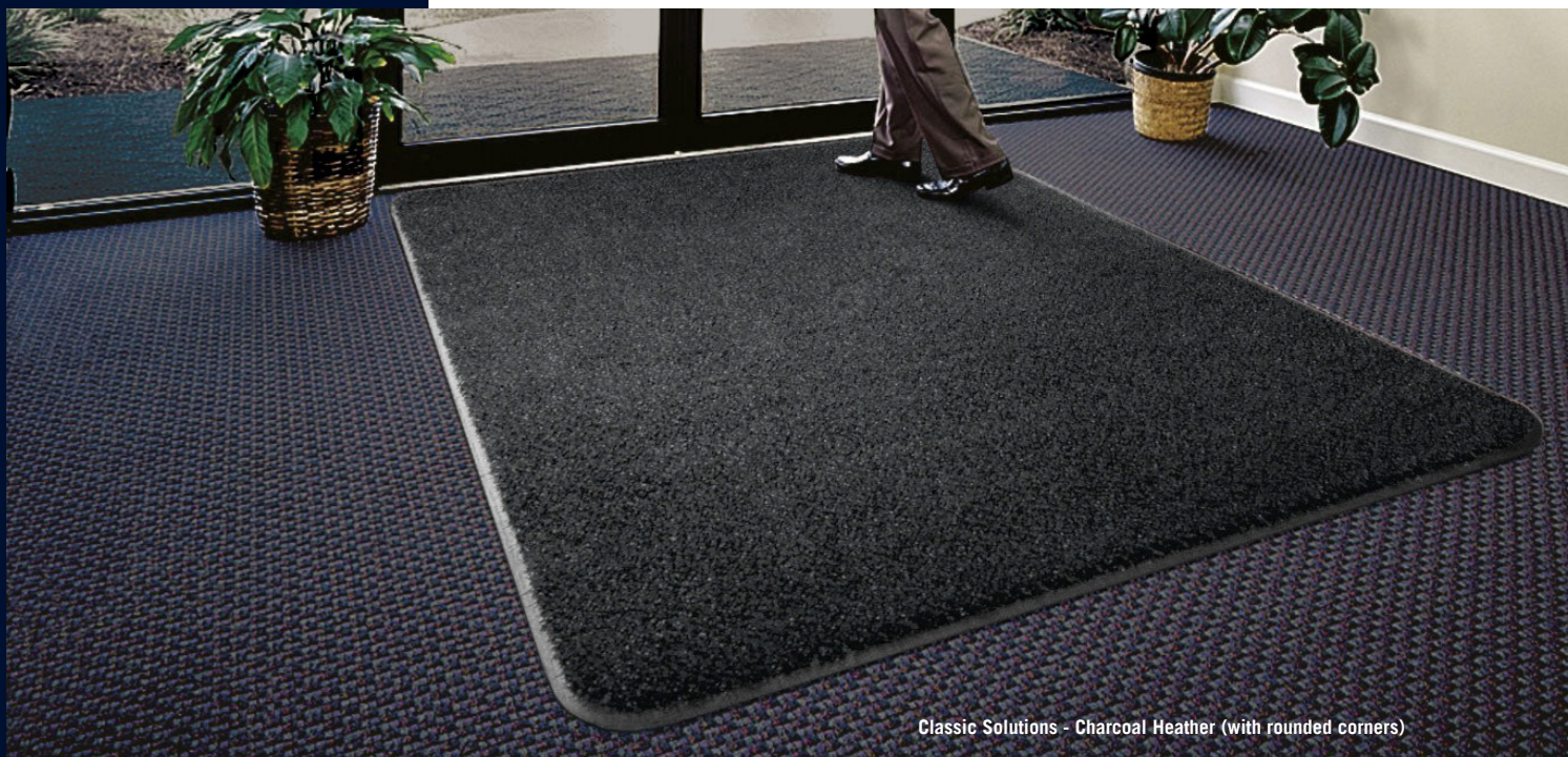
Classic Solutions - Charcoal Heather (with rounded corners)