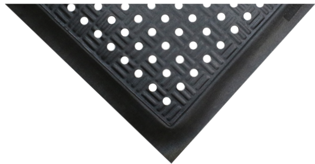
Comfort Station Max with drainage holes